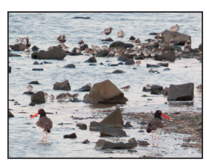
Shorebirds with American Oystercatchers in the foreground

bugs at bay. Starting from the parking lot, the group observed Barn Swallows and Great Egrets; a little down the trail, we found a Snowy Egret and a Yellow-crowned Night Heron. A few Song Sparrows sang from amongst the high tide bush and a pair of Greater Yellowlegs flew by, landing on the water's edge. As the tide rose, a number of shorebirds congregated on the point.