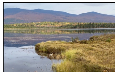
Sylvio O Conte NWR