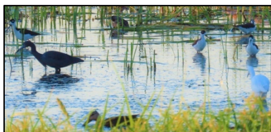
Estero Llano Grande State Park Texas.