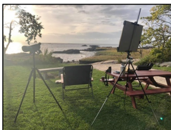
Chaffinch Island, Guilford, CT