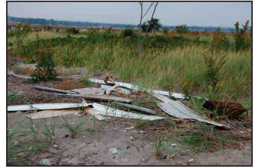
Debris from Super Storm Sandy at Milford Point