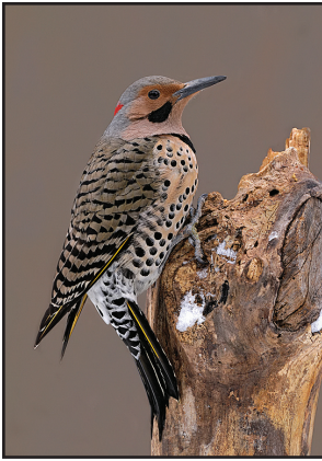
Tellow-shafted Northern Flicker