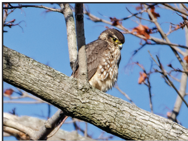
Merlin