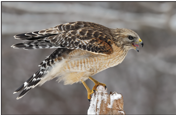
Red Shoulder Hawk