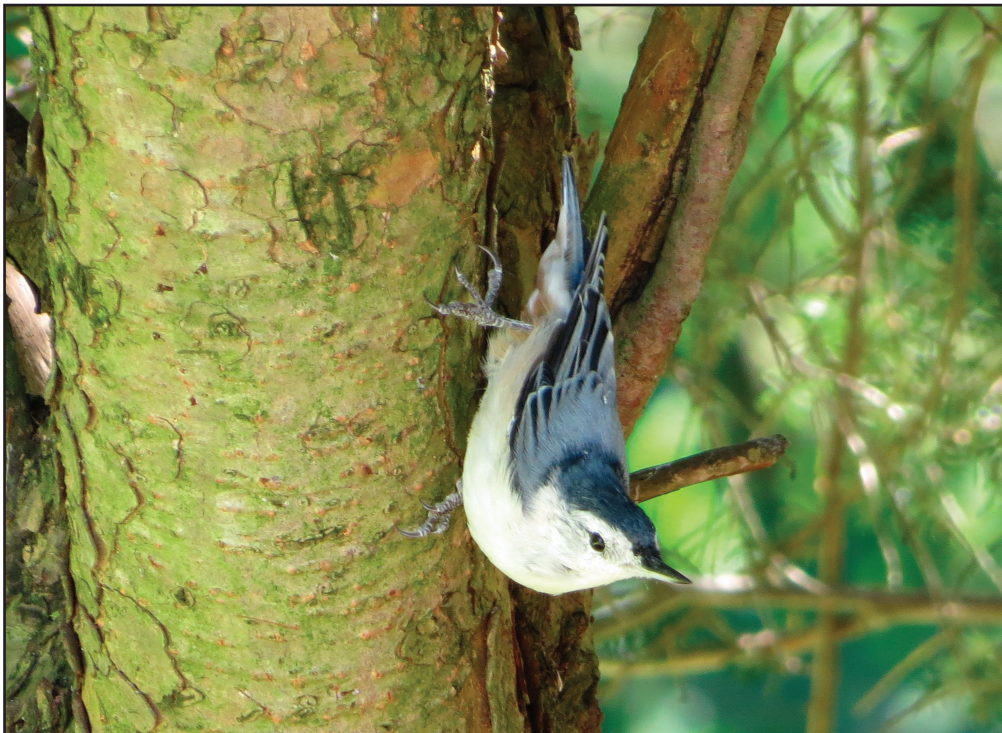
White-breasted Nuthatch on a tree in my yard