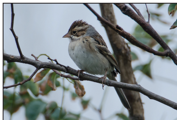
Clay Colored Sparrow at Silver Sands State Park