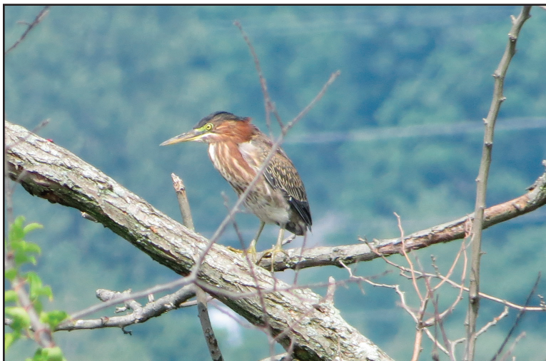
Juvenile Green Heron taken in the Quinnipiac River Marsh