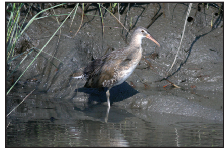
Clapper Rail