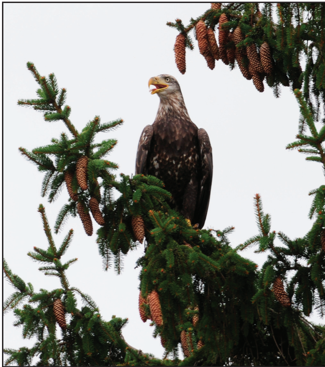
Immature Bald Eagle on Branford River