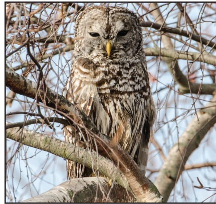
Barred Owl